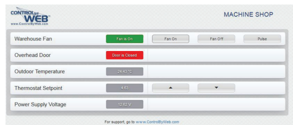
Example Control Page